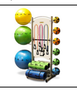
PRISM FITNESS Smart Deluxe Self-Guided Commercial Package