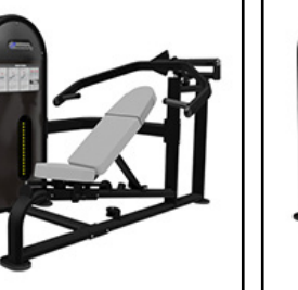
NAUTILUS Instinct® Dual Multi-Press