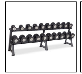
HAMPTON FITNESS Gel Grip Dumbbells + Saddle Racks