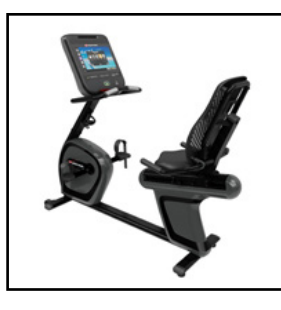
STAR TRAC 4 Series Recumbent Bike