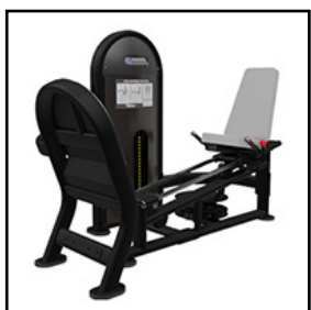
NAUTILUS Instinct® Dual Leg Press/ Calf Raise