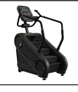
STAIRMASTER 4G Stepmill