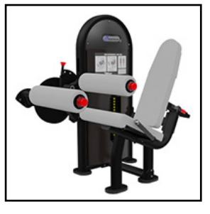
NAUTILUS Instinct® Dual Leg Extension/ Leg Curl