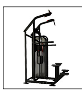
NAUTILUS Impact® Chin Dip Assist