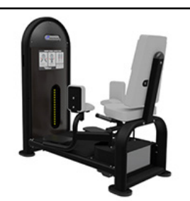
NAUTILUS Instinct® Dual Inner/ Outer Thigh