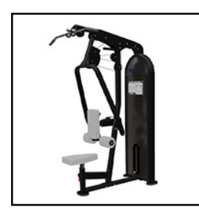
NAUTILUS Instinct Dual® Lat Pull Down/ Vertical Row