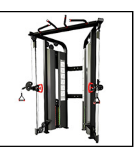
NAUTILUS Inspiration® Dual Adjustable Pulley

NAUTILUS Instinct® Dual Abdominal/ Lower Back