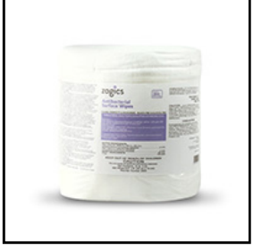
ZOGICS Antibacterial Disinfecting Gym Wipes