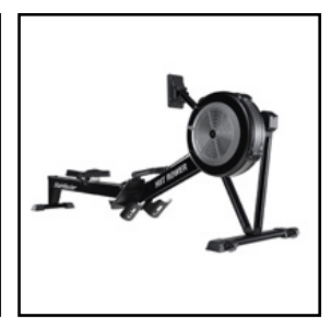
STAIRMASTER HIIT ROWER