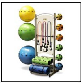
Smart Deluxe Self-Guided Commercial Package