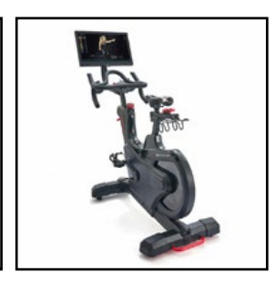
ECHELON EX-Pro Exercise Bike