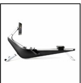
HYDROW The Hydrow Rower