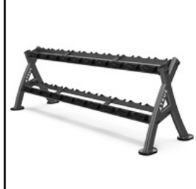
TRUE XFW-4700 Dumbbell Rack