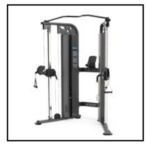
TRUE SM-1000 Functional Trainer