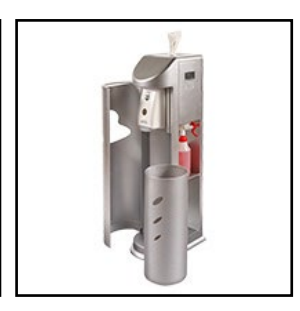
ZOGICS The Cleaning Station