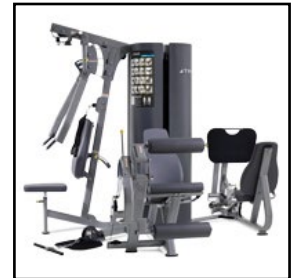
TRUE MP 3.5 Multigym