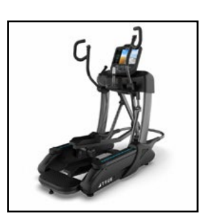
TRUE Spectrum Elliptical