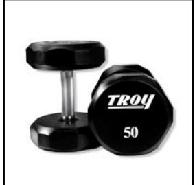
TROY FITNESS 12 Sided Urethane Dumbbells