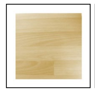
ECORE FLOORING Bounce2 Flooring