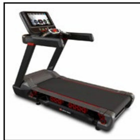
STAR TRAC 10TRX Freerunner Treadmill