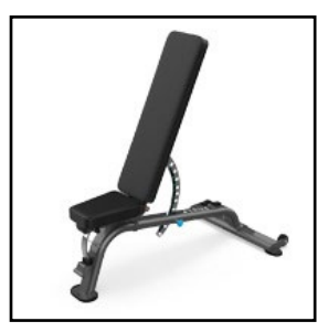
TRUE Flat/Incline/Decline Bench