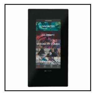
ECHELON Reflect 50" Touchscreen