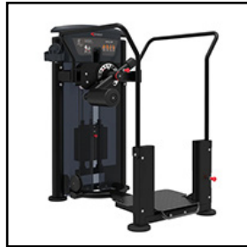
TKO Multi Hip