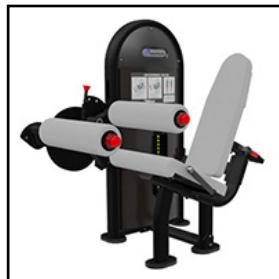
NAUTILUS INSTINCT® Dual Leg Extension/Leg Curl