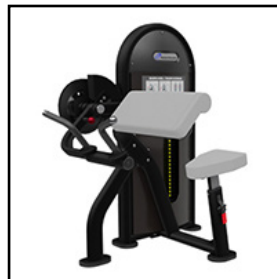
NAUTILUS INSTINCT® Dual Biceps Curl/Triceps Extension