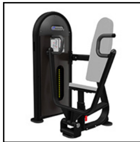
NAUTILUS INSTINCT® Chest Press