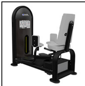
NAUTILUS INSTINCT® Dual Inner/Outer Thigh