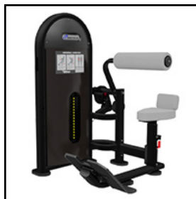
NAUTILUS INSTINCT® Dual Abdominal/Lower Back