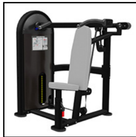
NAUTILUS INSTINCT® Shoulder Press