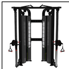
NAUTILUS INSTINCT® Dual Adjustable Pulley