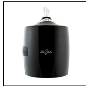
ZOGICS Upward Pull Wall-Mounted Dispenser