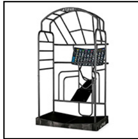
TRUE FITNESS True Stretch 800SS Club