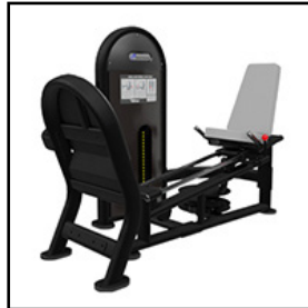
NAUTILUS INSTINCT® Dual Leg Press/Calf Raise