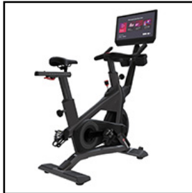
STAR TRAC Virtual Bike