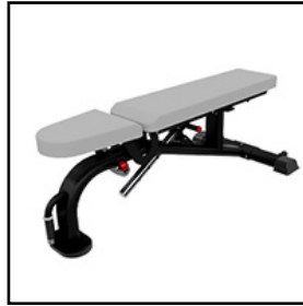
NAUTILUS INSTINCT® Multi-Adjustable Bench