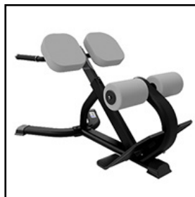
NAUTILUS INSTINCT® 45° Back Extension