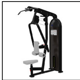
NAUTILUS INSTINCT® Dual Lat Pull Down/ Vertical Row