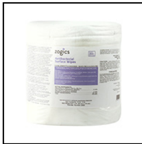
ZOGICS Antibacterial Disinfecting Gym Wipes