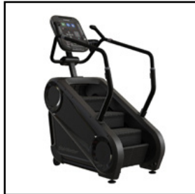
STAIRMASTER 4G Stepmill with 10" LCD Screen