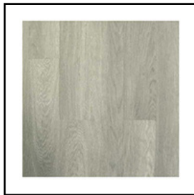
ECORE Heritage Motivate PVT Flooring (Smokey Taupe)