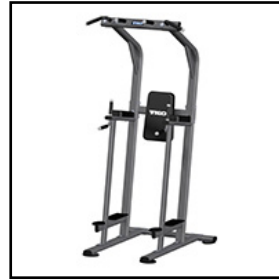
TKO VKR Power Tower