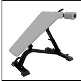
NAUTILUS INSTINCT® Adjustable Abdominal Decline Bench