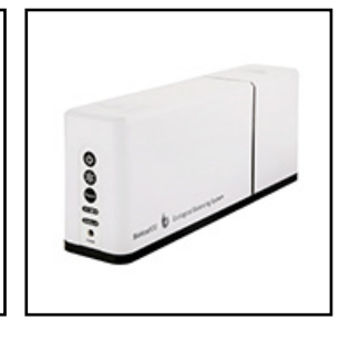
BETTERAIR Biotica800 Probiotic Surface & Air Cleaner