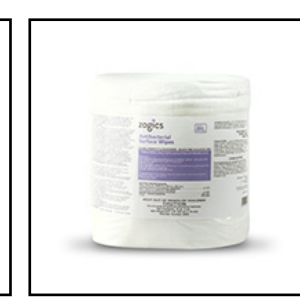
ZOGICS Antibacterial Disinfecting Gym Wipes