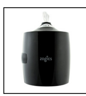
ZOGICS Upward Pull Wall Mounted Wipe Dispenser