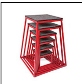
PRIME FITNESS Classic Plyo Boxes