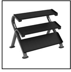
тко 3-Tier Dumbbell Rack