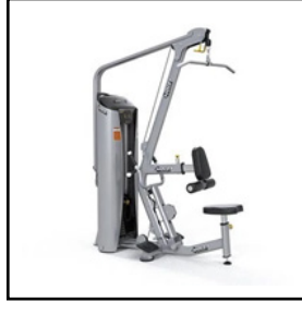
HOIST FITNESS Lat Pulldown/Mid Row