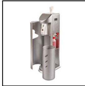
ZOGICS The Cleaning Station