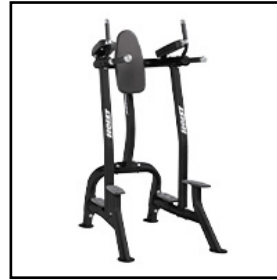
HOIST Vertical Knee Raise / Dip