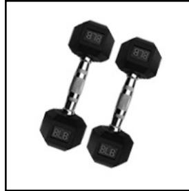
THROWDOWN HIIT Hex Dumbbells