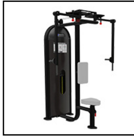
NAUTILUS Instinct Dual Pectoral Fly/ Rear Deltoid