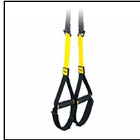
TRX Commercial Straps Club 4