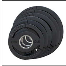
TKO Olympic Rubber Dual Grip Plates