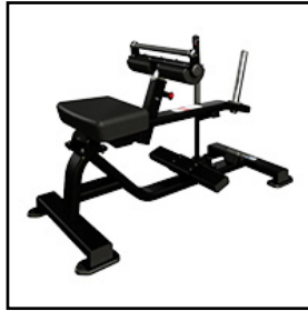
NAUTILUS Tilt Seat Calf