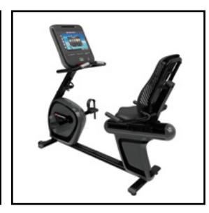
STAR TRAC 4 Series Recumbent Bike