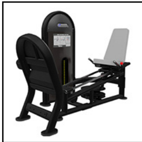
NAUTILUS Instinct® Dual Leg Press/ Calf Raise