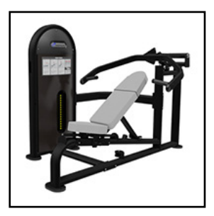
NAUTILUS Instinct® Dual Multi-Press