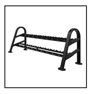
NAUTILUS Instinct® Dumbbell Rack 10-Pair/2 Tier