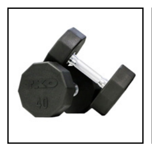
TKO 10-Sided Rubber Dumbbells