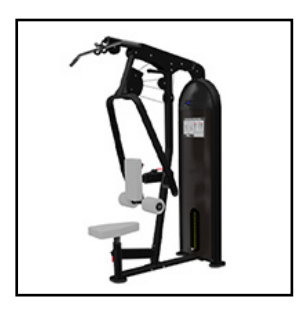
NAUTILUS Instinct® Dual Lat Pull Down/ Vertical Row