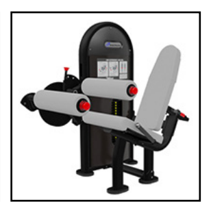
NAUTILUS Instinct® Dual Leg Extension/ Leg Curl