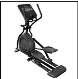
STAR TRAC 4 Series Cross Trainer