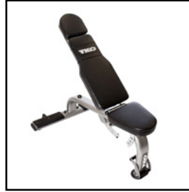
ТКО FID Bench