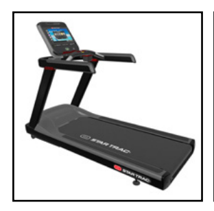
STAR TRAC 4 Series Treadmill