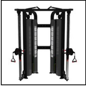
NAUTILUS Instinct® Dual Adjustable Pulley