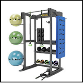
PRISM FITNESS Smart Deluxe Self-Guided Commercial Package